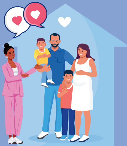
ICC + Family Relationship

We always want to collaborate together to create positive systems change that makes wellness more accessible to all.